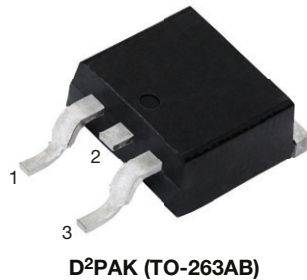
D 2 PAK (TO-263AB)