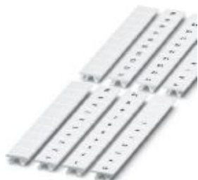
Zack marker strip, 10-section, horizontally labeled with the consecutive numbers: 91 ... 100, white, width: 8 mm

Please be informed that the data shown in this PDF Document is generated from our Online Catalog. Please find the complete data in the user's documentation. Our General Terms of Use for Downloads are valid ( http://phoenixcontact.com/download )