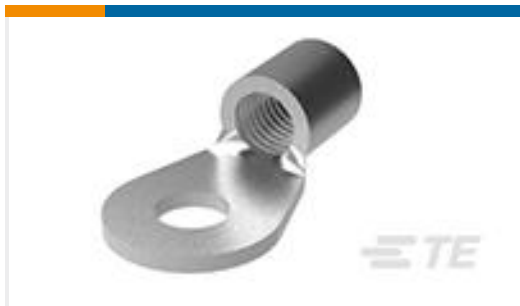
TE Part #321298 TERMINAL,SOLIS R 6 10