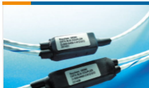
TE Part #A85351-000 D-500-0255-431