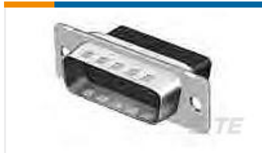
TE Part #205206-9 CRIMP SNAP PLUG ASSY,SIZE 2