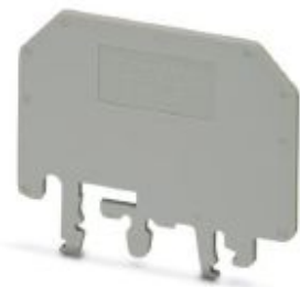
Partition plate, length: 60 mm, width: 2 mm, height: 48.9 mm, color: gray

Please be informed that the data shown in this PDF Document is generated from our Online Catalog. Please find the complete data in the user's documentation. Our General Terms of Use for Downloads are valid ( http://phoenixcontact.com/download )