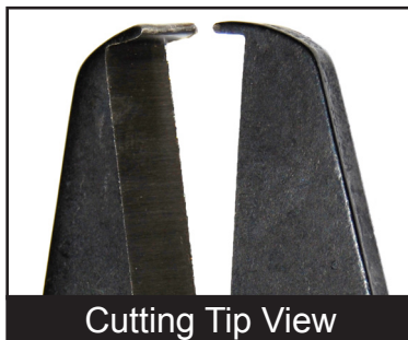
Cutting Tip View