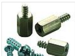
Screws (SHR) and distance bolts (DIBLZ) for mounting bosses in plastic enclosures