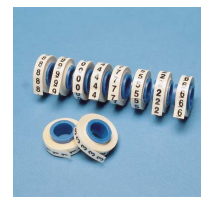
PM D R - * - *