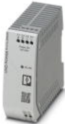
Primary-switched UNO POWER power supply for DIN rail mounting, input: 1-phase, output: 15 V DC/55 W

Please be informed that the data shown in this PDF Document is generated from our Online Catalog. Please find the complete data in the user's documentation. Our General Terms of Use for Downloads are valid ( http://phoenixcontact.com/download )