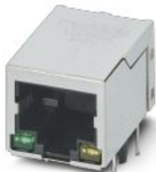
RJ45 PCB connectors, degree of protection: IP20, 10 Gbps

Please be informed that the data shown in this PDF Document is generated from our Online Catalog. Please find the complete data in the user's documentation. Our General Terms of Use for Downloads are valid ( http://phoenixcontact.com/download )