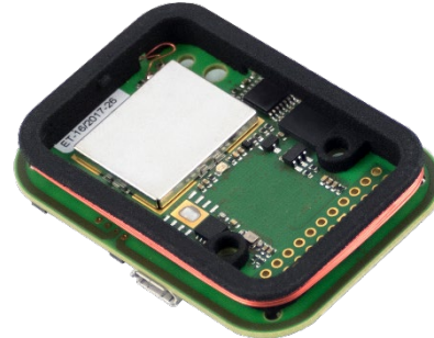
TWN4 MultiTech 3 M LF HF PCB bottom view

TWN4 MultiTech 3 M LF HF integrates RFID (125 kHz and 13.56 MHz) and NFC capabilities into a compact but powerful reader. Its reduced size combined with optimized read/write performance makes it the perfect reader for all applications where small size and full performance matters, e.g. print solutions, driver identification, POS integration and many more. Furthermore, TWN4 MultiTech 3 M LF HF provides access to most common host interfaces such as USB, serial (TTL) or I 2 C which are readily accessible through an on-board connector.