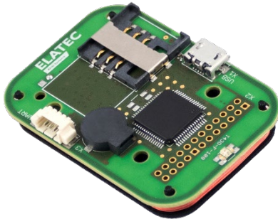
TWN4 MultiTech 3 M LF HF PCB top view