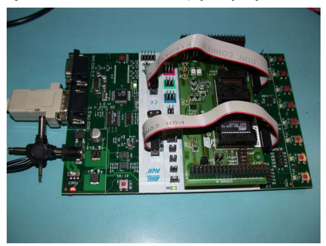
Figure 1-1. Annexe 1 : STK500, STK520 Parallel programming configuration