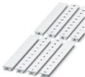
Zack marker strip, 10-section, horizontally labeled with the consecutive numbers: 1 ... 10, white, width: 8 mm

Please be informed that the data shown in this PDF Document is generated from our Online Catalog. Please find the complete data in the user's documentation. Our General Terms of Use for Downloads are valid ( http://phoenixcontact.com/download )