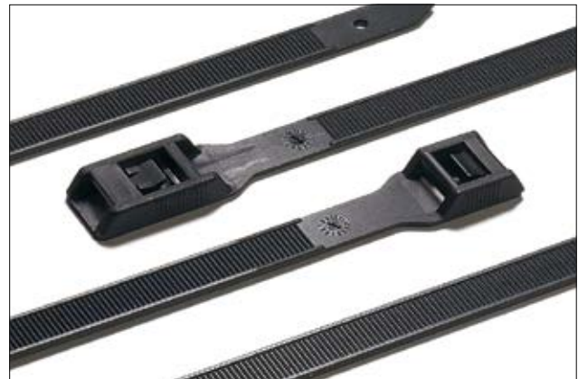
Low profile cable tie, RPE / PE-Series.