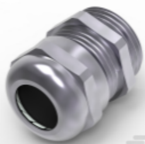
TE Part # T3609320102-000 DLX-32-M