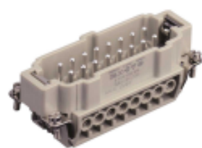
TE Part # T2040162101-000 HE-016-M