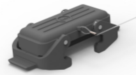
TE Part # T1010161200-000 H16B-KDTP