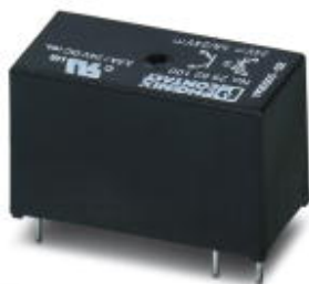
Plug-in miniature solid-state relay, power solid-state relay, 1 N/O contact, input: 24 V DC, output: 3 - 33 V DC/5 A

Please be informed that the data shown in this PDF Document is generated from our Online Catalog. Please find the complete data in the user's documentation. Our General Terms of Use for Downloads are valid ( http://phoenixcontact.com/download )