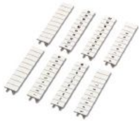
Zack marker strip, 10-section, horizontally labeled with the consecutive numbers: 81 ... 90, white, width: 5 mm

Please be informed that the data shown in this PDF Document is generated from our Online Catalog. Please find the complete data in the user's documentation. Our General Terms of Use for Downloads are valid ( http://phoenixcontact.com/download )