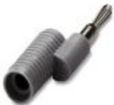
Reducing plug, color: gray