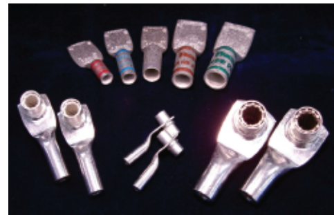
Industry Standard Color Coding

Notice: Specifications are subject to change without notice. Contact your nearest Amphenol Corporation Sales Office for the latest specifications. All statements, information and data given herein are believed to be accurate and reliable but are presented without guarantee, warranty, or responsibility of any kind, expressed or implied. Statements of suggestions concerning possible use of our products are made without representation or warranty that any such use is free of patent infringement and are not recommendations to infringe any patent. The user should assume that all safety measures are indicated or that other measures may not be required. Specifications are typical and may not apply to all connectors.