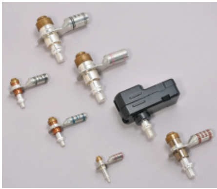
4 Sizes, 7 Ampacities

Ideal markets include Medical and Test Equipment, Process Control, Heavy Equipment and Rail. Any applications that use high current, frequently plugged & unplugged cables or a “plug and play” setup would be an ideal “fit” for the SurLok.