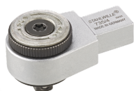
58250004 Fine tooth insert ratchet