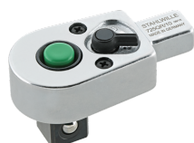
58253004 QuickRelease ratchet insert tool