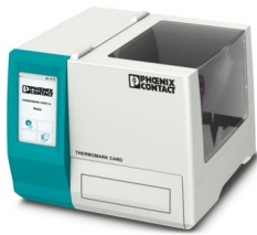
Thermal transfer printer for cards

https://www.phoenixcontact.com/us/products/5146464