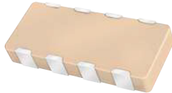
0612 - 4 Element

As the market leader in the development and manufacture of capacitor arrays AVX is pleased to offer a range of AEC-Q200 qualified arrays to compliment our product offering to the Automotive industry. Both the AVX 0612 and 0508 4-element capacitor array styles are qualified to the AEC-Q200 automotive specifications.