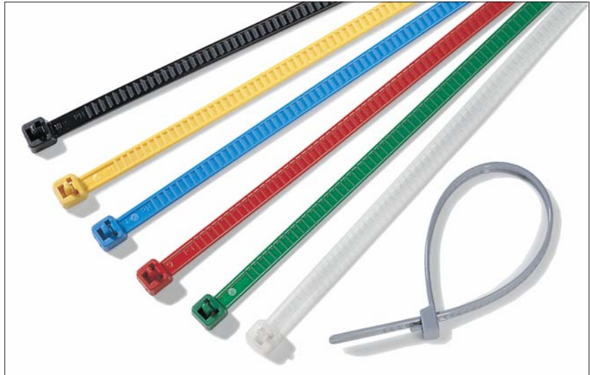
The LR55 cable ties are reusable and ideal for colour coding.

These releasable and reusable ties are ideal where temporary installation or the addition or removal of cables is required, for example: logistic identification (colour coding), packaging industries, cable harness manufacturing.