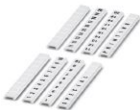
Zack marker strip flat, 10-section, vertically labeled with the consecutive numbers: 11 ... 20, white

Please be informed that the data shown in this PDF Document is generated from our Online Catalog. Please find the complete data in the user's documentation. Our General Terms of Use for Downloads are valid ( http://phoenixcontact.com/download )