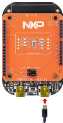
Figure 2: Connect board to computer