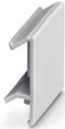
Filler plug for unoccupied terminal points, color: Light gray

Please be informed that the data shown in this PDF Document is generated from our Online Catalog. Please find the complete data in the user's documentation. Our General Terms of Use for Downloads are valid ( http://phoenixcontact.com/download )