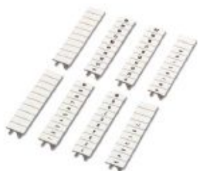
Zack marker strip, 10-section, horizontally labeled with the consecutive numbers: 31 ... 40, white, width: 5 mm

Please be informed that the data shown in this PDF Document is generated from our Online Catalog. Please find the complete data in the user's documentation. Our General Terms of Use for Downloads are valid ( http://phoenixcontact.com/download )