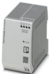
Primary-switched UNO POWER power supply for DIN rail mounting, input: 1-phase, output: 48 V DC/100 W

Please be informed that the data shown in this PDF Document is generated from our Online Catalog. Please find the complete data in the user's documentation. Our General Terms of Use for Downloads are valid ( http://phoenixcontact.com/download )