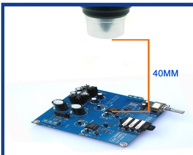
Tall distance Small magnification