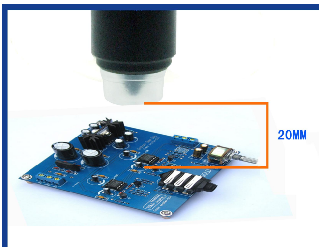
Short distance High magnification

The nearest distance between the machine lens and the object is about 10mm, when the magnification is the maximum. On the contrary, the farther away the lens is from the object, the smaller the magnification is.