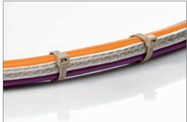
The contoured head takes up less space, gives a low insertion force and offers high strength.