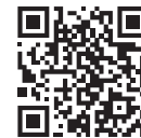
Application video: PEEK