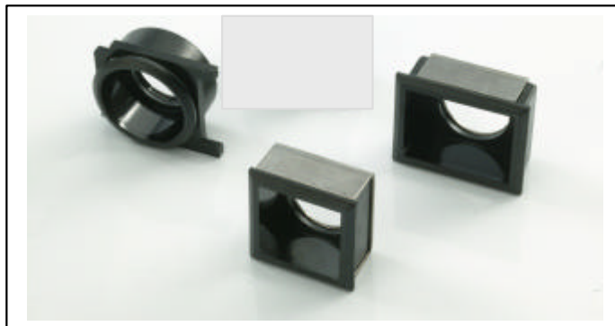
Flush keyswitch bezel set 331-4964

This goes into a 21 by 27mm hole into which the user fits the keyswitch above with which he has snapped on the rectangular hood