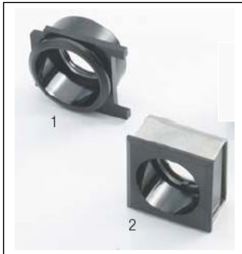
Flush selector bezel set 331-4970

This goes into a 22.5mm hole and has a round hole in the middle to fit the selector.