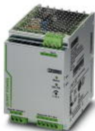
Primary-switched QUINT POWER power supply for DIN rail mounting with SFB (Selective Fuse Breaking) Technology, input: 1-phase, output: 12 V DC/20 A

Please be informed that the data shown in this PDF Document is generated from our Online Catalog. Please find the complete data in the user's documentation. Our General Terms of Use for Downloads are valid ( http://phoenixcontact.com/download )