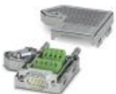
D-SUB connector, 9-pos., male connector, one cable entry < 35°, universal type for all systems, pin assignment: 1, 2, 3, 4, 5, 6, 7, 8, 9 to screw connection terminal block

D-SUB bus connector - SUBCON 9/M-SH - 2761509