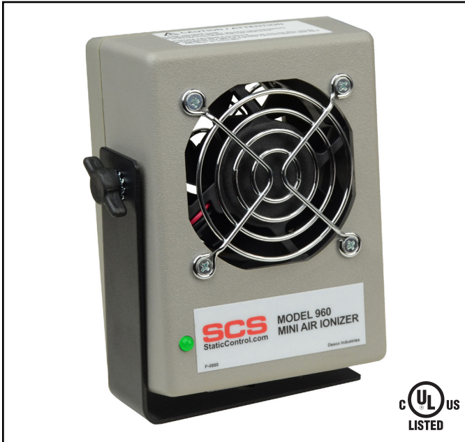
Figure 1. SCS 960 Mini Air Ionizer