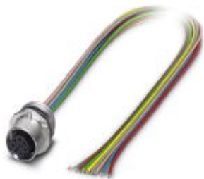
Flush-type connector, Universal, 8-position, Socket, straight, M12-SPEEDCON, A-coded, Front mounting, M16 x 1.5, Individual wires, cable length: 0.5 m

Please be informed that the data shown in this PDF Document is generated from our Online Catalog. Please find the complete data in the user's documentation. Our General Terms of Use for Downloads are valid ( http://phoenixcontact.com/download )