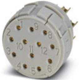
Contact insert, number of positions: 16, type of contact: Socket, Solder connection

Please be informed that the data shown in this PDF Document is generated from our Online Catalog. Please find the complete data in the user's documentation. Our General Terms of Use for Downloads are valid ( http://phoenixcontact.com/download )