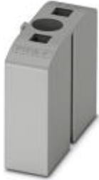
Flange, with screw-on fixing, width: 7.7 mm, height: 17.7 mm, color: gray, mounting type: Screw mounting

Please be informed that the data shown in this PDF Document is generated from our Online Catalog. Please find the complete data in the user's documentation. Our General Terms of Use for Downloads are valid ( http://phoenixcontact.com/download )