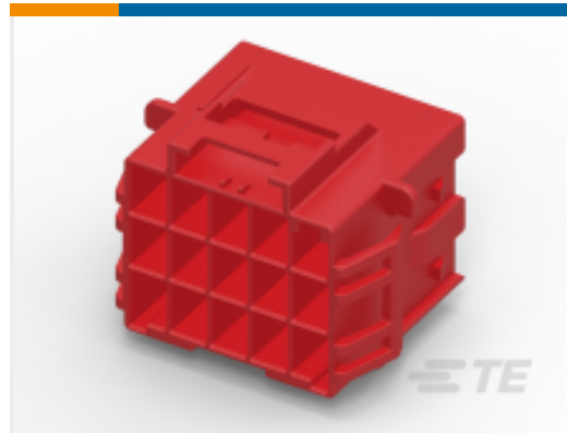
TE Part #5-1971772-2 POWER TRIPLE LOCK High Temperature Caps