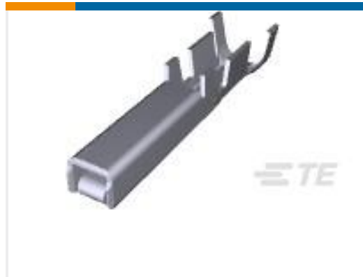
TE Part #353717-2 DYNAMIC D-3 REC CONT. 3L AU 0.38 L/P