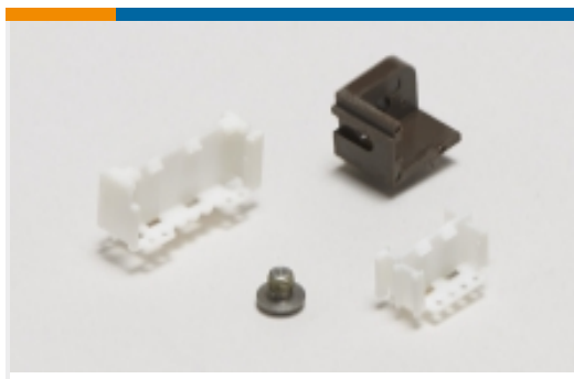
PCB Connector Mounting(1)