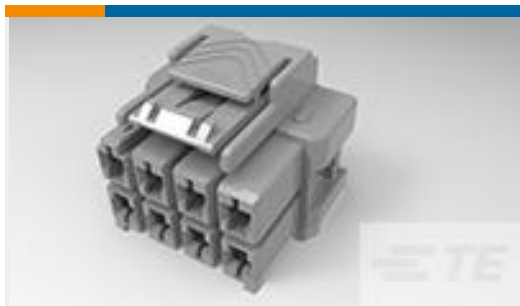
TE Part #5-1971776-4 PTL 2X4 PLUG HSG HIGH TEMP KEY A LGR