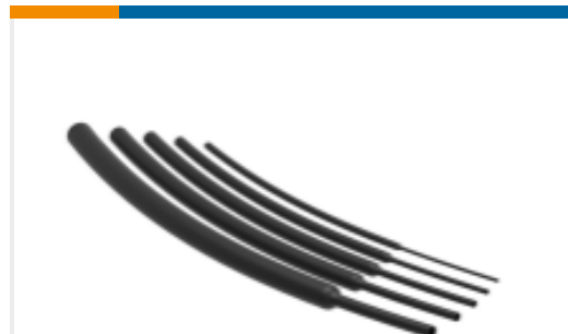
TE Part #NB13052001 RNF-100-1-BK-STK