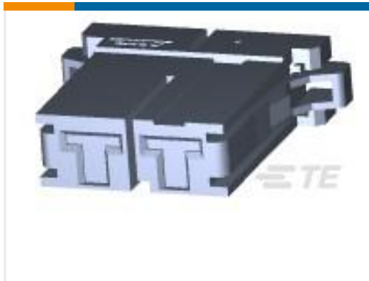
TE Part #2-179958-2 DYNAMIC D-5200S REC HSG 2P K/Y