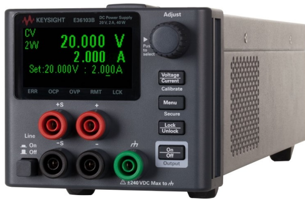
Option J01 recessed binding posts

Do you need to convert the power supply for different mains power? The two switches on the bottom of the instrument make it straightforward. See the product manual for details.