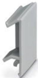
Filler plug for unoccupied terminal points, color: Light gray

Please be informed that the data shown in this PDF Document is generated from our Online Catalog. Please find the complete data in the user's documentation. Our General Terms of Use for Downloads are valid ( http://phoenixcontact.com/download )