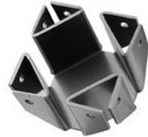
Representative Photo Only