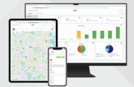
Manage this device with Digi Remote Manager