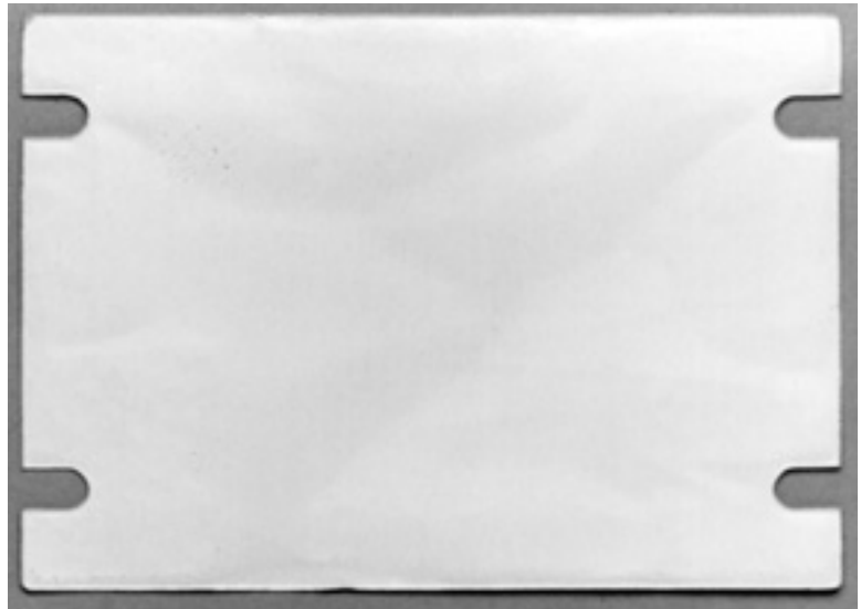
HSP3 Series: Three Phase GN0 and GN3

HSP1 for Single Phase Relay. HSP3 for 3 phase GN0 Series and GN3 Series. Sold in multiples of 25 (1 package) per part number.