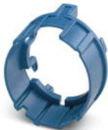
Circular connectors (cable-side), Range of articles: PRC, Coding element, color: blue

Please be informed that the data shown in this PDF Document is generated from our Online Catalog. Please find the complete data in the user's documentation. Our General Terms of Use for Downloads are valid ( http://phoenixcontact.com/download )