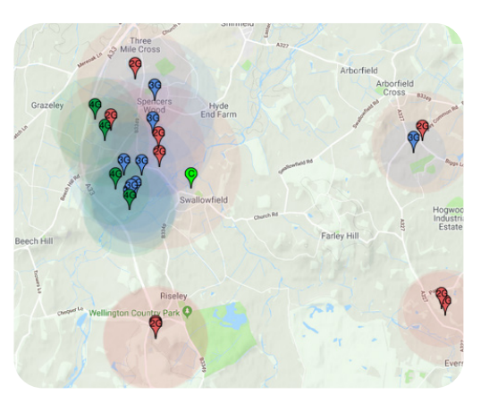
Integrated mapping portal (registration required)