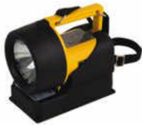
C-251 HV/LV charger for use with H-251E or H-251 MK2