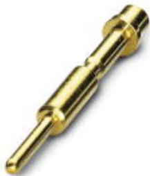
Crimp contact, turned, Single contact, contact diameter: 1 mm, crimp range: 0.06 mm 2 ... 0.25 mm 2

Please be informed that the data shown in this PDF Document is generated from our Online Catalog. Please find the complete data in the user's documentation. Our General Terms of Use for Downloads are valid ( http://phoenixcontact.com/download )