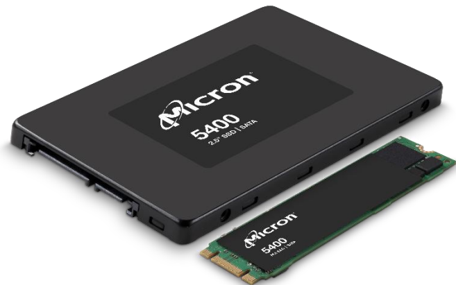
Micron 5400 SSD

Additional firmware-based security options like TCG Enterprise and TCG Opal combine with integrated, hardware-based AES 256-bit encryption for full performance plus extra security and peace of mind. 5