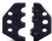
Spare die for CRIMPFOX-RC 10

Replacement die - CRIMPFOX-RC 10/DIE - 1212062