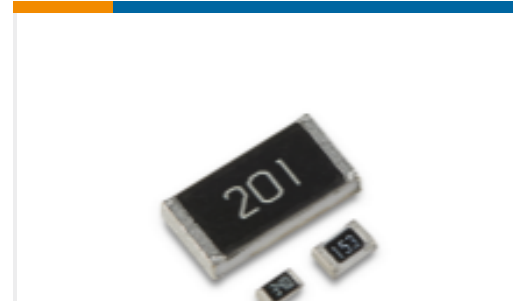
TE Part #5-2176331-4 CRGP 2512 270K 1%