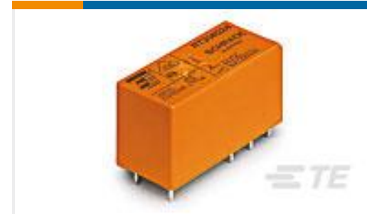
TE Part #7-1415014-1 RT31LA24