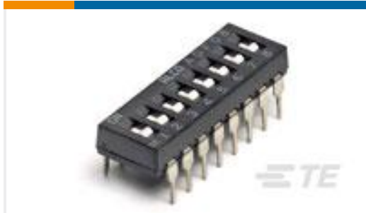
TE Part #2-1825059-3 ADF05ST04=DIP SWT,FLUSH,SMT-GW