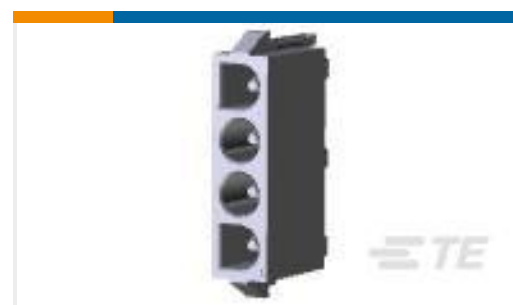
TE Part #641968-3 04P UMNL PIN HDR ASSY POL 94VO