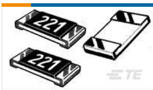
TE Part #9-2176070-2 3521 62K 1% 2W