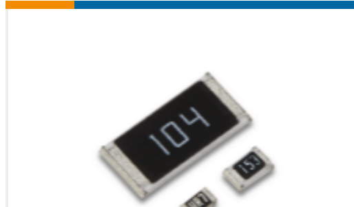
TE Part #4-2176341-6 CRGCO 0805 56K 1%