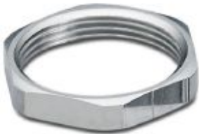
M18 x 0.75 locking nut

Please be informed that the data shown in this PDF Document is generated from our Online Catalog. Please find the complete data in the user's documentation. Our General Terms of Use for Downloads are valid ( http://phoenixcontact.com/download )